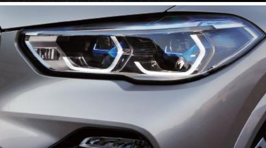
Adaptive LED headlights with BMW Laserlight incl. BMW Selective Beam

*Actual car specifications may vary from the picture shown above. Details for the options available, please speak to your authorized BMW dealer.