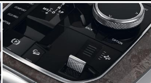
Adaptive 2-axle air suspension with automatic self-levelling suspension, selectable on five levels in total of 80mm adjustment travel