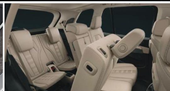
3 rd row seats with 2 nd row of seats incl. comfort entry and infinitely variable electric seat backrest tilt adjustment and fore-and aft adjustment incl. Comfort cushions.